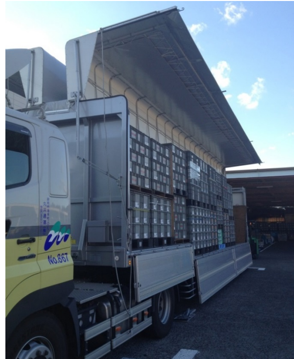
THINKING AHEAD – A TRUCK WITH GULL-WING DOORS

The first two levels (necessity and vision) come under the heading of leadership, which is primarily about winning people over to change through communication. The two lower levels (objectives and methods) apply to the field of management, where the aim is to steer the improvement process by means of a strategy, key figures, and instruments such as shop floor management.