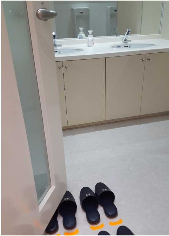
5S APPLIES EVERYWHERE – DESIGNATED SPACE FOR TOILET SLIPPERS AT AVEX 2016