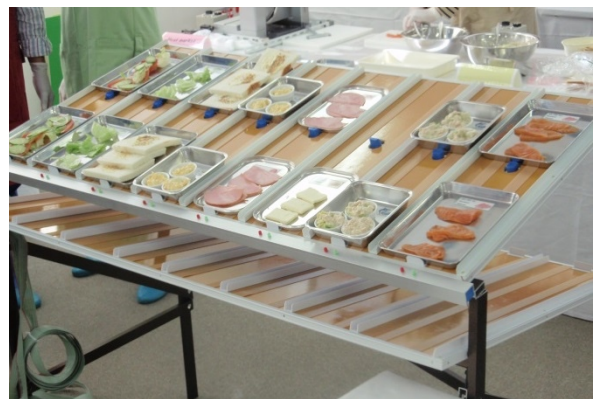
'PLAYFULLY SERIOUS' – SANDWICH TRAINING AT KSK

What else stands out? The global success of lean production continues apace. The decline in the company's key figures has not yet been used to proclaim the end of the Toyota production system. On the contrary, the increasing spread and mastery of this methodology is one of the reasons why Toyota has lost some of its exceptional status. Nevertheless, in terms of lean processes and improvement activities, the aforementioned Harbour Report 2008 still concluded that: "Toyota remains the industry benchmark [...]" (Oliver Wyman 2008).