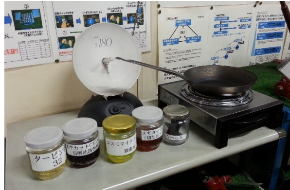
'MANUFACTURING WITH 5 SENSES' – OLFACTORY TRAINING AT KSK 2013

Arubeki sugata (literally 'the form as it should be') is another central concept. It holds that the target state should first be defined and described as a tangible vision, before any improvement measures are taken. Although many companies that use the kaizen improvement methodology have mastered the tools, they often fail to define the target state in clear and simple terms. The second level – the level of vision – is disregarded; the question of 'where to' is left unanswered. Rather like the Toyota reform, where the need for renewed and intensified efforts to do better was properly justified at the first level, Toyota's measures can likewise be identified at the other three levels. The target state of change – the second level – was described in the aforementioned Global Vision 2005 and its follow-ups Global Vision 2010 and 2020. The specific visionary part of the earlier versions was that Toyota would supplant Ford and General Motors as the world's largest car manufacturers and become the 'leading company' of the 21 st century. The Global Visions also include tangible figures on how return on sales or market share would develop, both worldwide and for individual regions. This is where the field of Leadership – Communication – transitions to that of Management – Control.