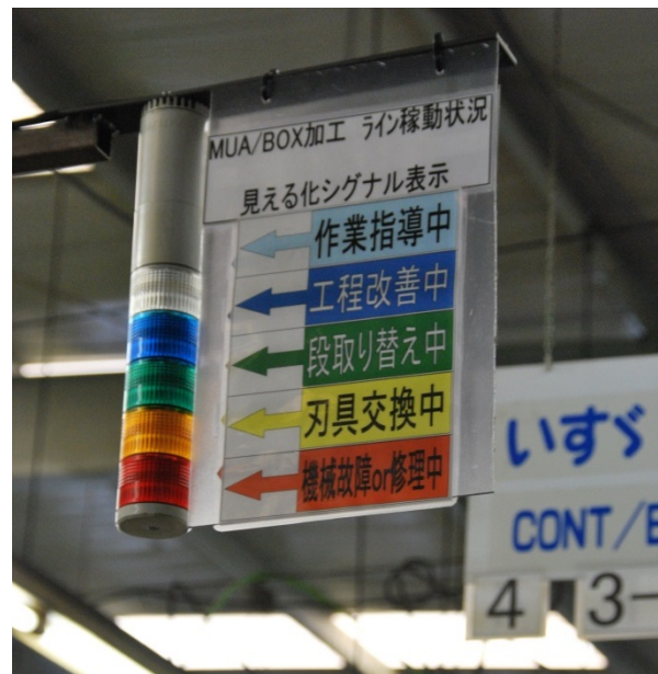
STATUS VISUALISATION – SIGNAL LIGHTS FOR MACHINERY AT KSK 2010

Accordingly, human resource concepts have been in place for decades that promote employee development by means of development paths. Underlying this is a keen awareness of the dependence on employees as the most important resource of all.