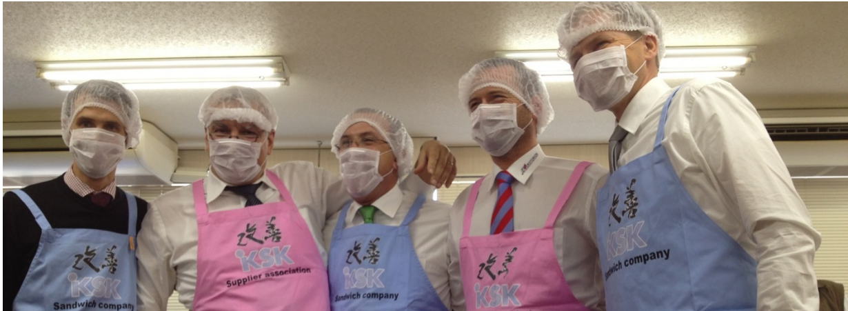
PARTICIPANTS AT WORK – SANDWICH TRAINING AT KSK 2012

Whoever wants to work with lean methodology is, therefore, well advised to continue studying Toyota. And there is certainly no shortage of questions that arise from the practical application of TPS. Most importantly, what are the features 'around the production system', i. e. beyond the concept of process design, that are responsible for the continuous improvement effect. The following section classifies the TPS into a production-wide system of corporate management and also clarifies the meaning of key terms.