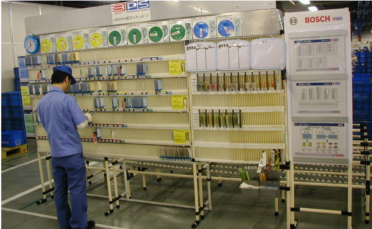
ANALOGUE PRODUCTION CONTROL – BOX-COMPARTMENTS AT BOSCH 2006