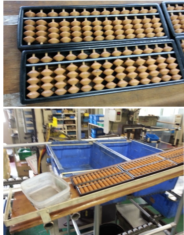
"I USED TO BE AN ABACUS, NOW I'M A ROLLER CONVEYOR" – PRAGMATIC REPURPOSING AT KSK 2013

The visionary courage of Toyota's management is directly related to the confidence they have in the potential of their employees. These employees are called upon to face challenges and find innovative solutions to new problems. For instance, when planning the capacity of new production lines at a level of plant availability not yet reached. Another example of this is how the hybrid drive was developed in the extremely short time frame of just four years from kick-off in September 1993 to market launch in October 1997. (Liker 2004)