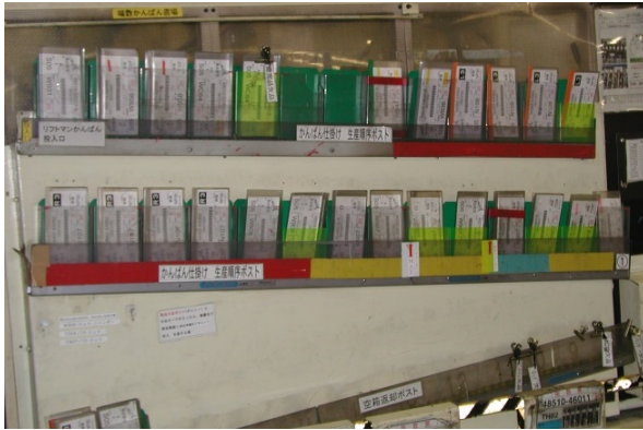
ANALOGUE PRODUCTION MANAGEMENT – KANBAN RAILS AT KYB 2002

alternative model for corporate management among Western car manufacturers? And can it be seen as a viable alternative model to Anglo-Saxon-style capitalism?