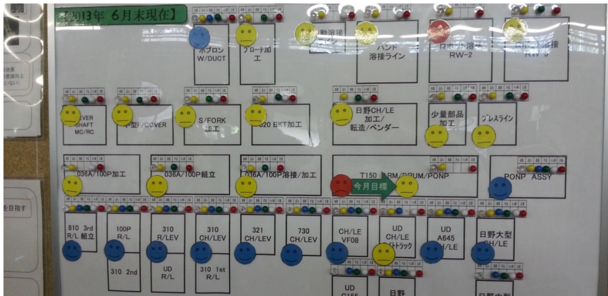
'MAP OF 6 ZERO-ACTIVITIES' – STATUS-VISUALISATION AT KSK 2013

In the midst of a worldwide boom, the Toyota Production System (TPS) has long since transcended the confines of the automotive industry as a blueprint for how to organise value-added processes. TPS used to be thought of as simply a concept and an instrument for designing and improving production processes. However, the focus on production is not sufficient in itself to explain Toyota's success in manufacturing excellence and making continuous improvements. Rather, one should examine the close relationship between the production concept and various other factors and practices, which goes beyond the strict definition of a production system. In this article, TPS finds its place in a production-wide system of corporate management. Besides the production system, this 'Toyota Corporate System' consists of three further elements: 'Change Management', 'Incentive Management' and the 'Corporate Culture of Improvement'.