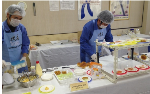
'PLAYFULLY SERIOUS' – SANDWICH TRAINING AT KSK

That said, observers have been impressed by the rapid restoration of supply chains and the production restart in 2011 following the natural disasters in Japan and Thailand. Toyota stood out among Japanese manufacturers in 2012 with the strongest growth in sales and profits, having regained its position as the world's largest automobile manufacturer. 1